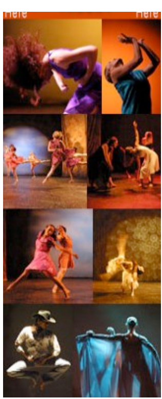
www.ProfessionalChoreography.cor Ads by Google